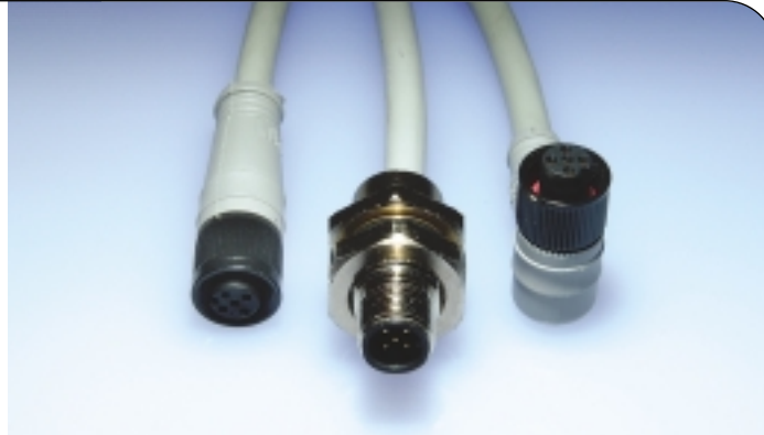
Back panel mount Micro-Change® connectors brings DeviceNet "plug-and-play" connectivity into and out of the enclosure.