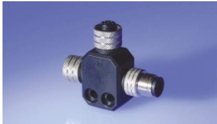
Thin media tee allows you to use "thin" media as the trunk line for cleaner, smaller cable "dressing."