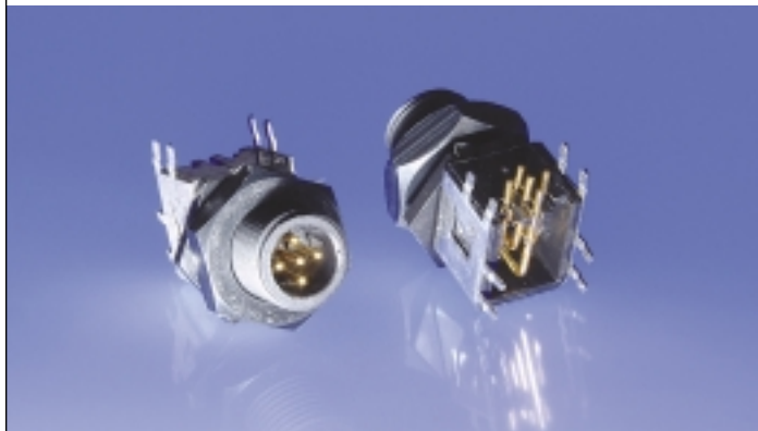
Mini PCB connectors – both male and female versions allow the OEM to provide DeviceNet enabled products.