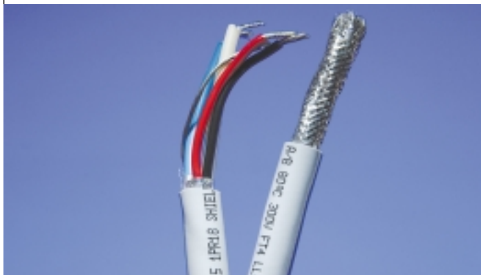
Tray-Rated DeviceNet Cabling insures you are in compliance for routing DeviceNet cable in trays near other 600V-rated cabling