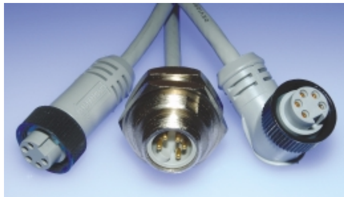
Back Panel Mount Mini-Change® connectivity brings DeviceNet "plug-and-play" connectivity into and out of the enclosure

The Brad Harrison® line up of DeviceNet media is the standard by which all other DeviceNet connection media are measured. We pioneered the market for miniature industrially rated sealed connectors presenting the first quick disconnect alternative to hardwiring. Today Brad Harrison products bring this same quality and durability to the same connectors used in DeviceNet networks. Choices and feature-rich products make them reassuring to specify as part of your DeviceNet system. From tees, splitters and passive boxes, diagnostic aids such as the Power Monitor tees, to the simple-to-use handheld diagnostic Netmeter, Brad Harrison is your choice for DeviceNet infrastructure products.